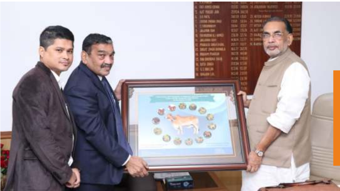
Dr Shyam Zavar with Shri Radha Mohan Singh, Hon'ble Minister of Agriculture and Farmers' Welfare, Govt of India on 19.12.18