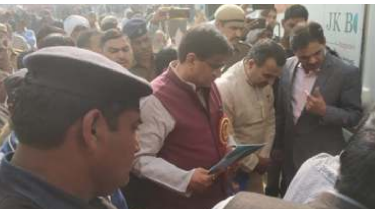
Dr. Sanjeev Balyan, Ex-State Minister of Agriculture, Govt. of Haryana and Shri Om Prakash Dhankar, Minister of Animal Husbandry & Dairying, Govt. of Haryana visiting our Mobile ET-IVF Van

Approx. 15,000 farmers visited the exhibition and a large number of farmers having elite animals of Hariana, HF, Sahiwal, Gir and Murrah breed won the prizes.