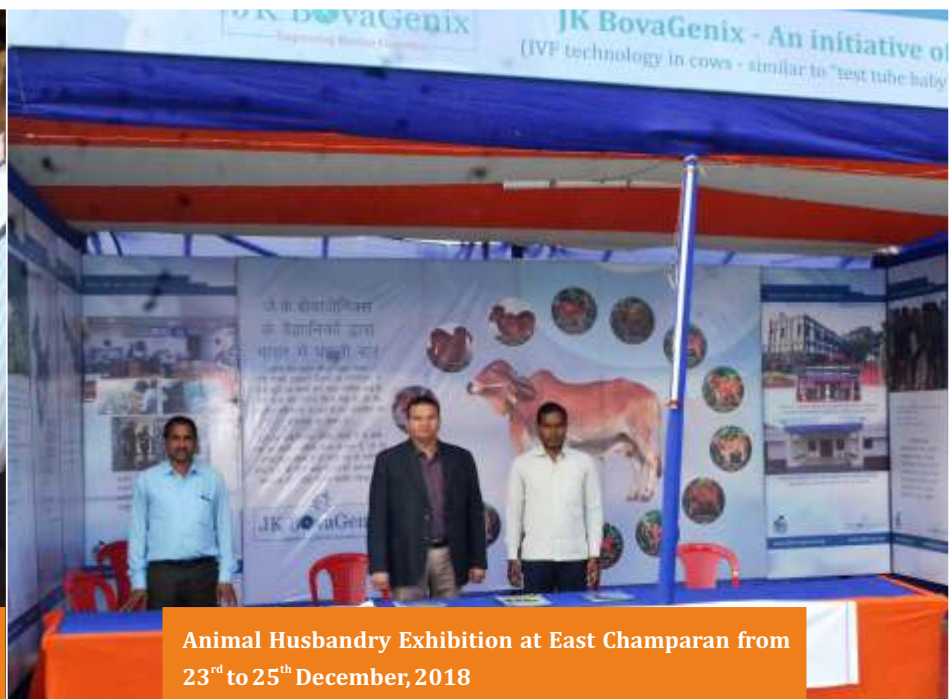
Animal Husbandry Exhibition at East Champaran from 23 rd to 25 th December, 2018