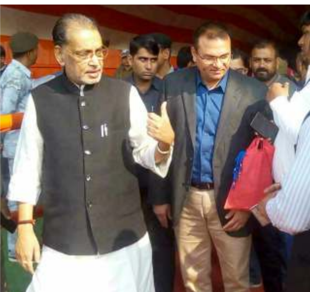
Shri S.K. Chandrakar, Country Director with Shri Radha Mohan Singh - Hon'ble Union Minister of Agriculture during the exhibition