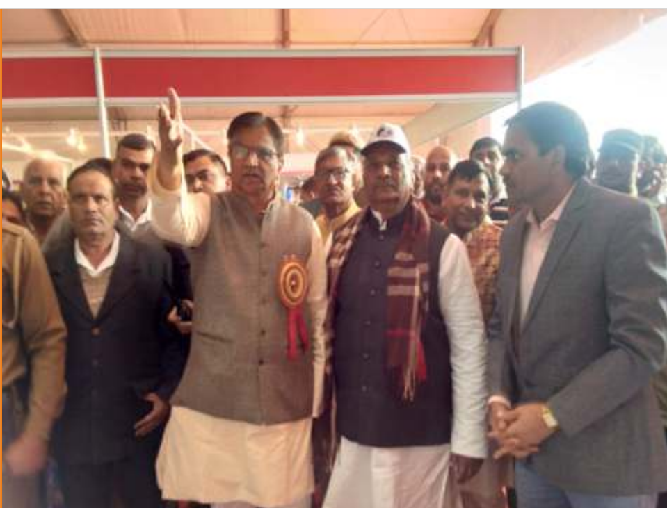
Shri Om Prakash Dhankar, Minister of AH & Dairying, Govt. of Haryana during the exhibition