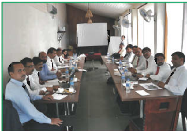
Senior Management Team during Annual Review Meeting

All the participants shared their wealth of field experiences and further enriched with their valuable inputs through their deliberations on various issues.