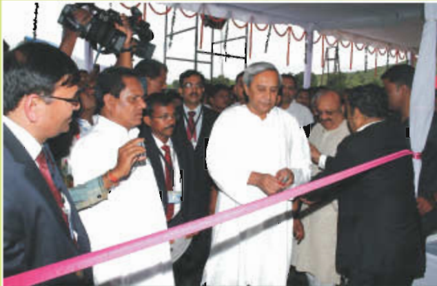
Shri Naveen Patnaik, Hon'ble Chief Minister of Odisha inaugurating the Cattle Breed Improvement Programme in Odisha state.