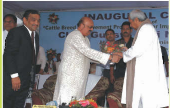
Shri Naveen Patnaik, Hon'ble CM of Odisha and Dr. Vijaypat Singhania, Hon'ble Chairman of JK Trust Gram Vikas Yojana at Inaugural ceremony at Koraput on 4th October 2012

Hon'ble Chief Minister of Odisha, Shri Naveen Patnaik launched the much-awaited Cattle Breed Improvement Programme for improving livelihood of Tribals of Odisha. This programme is sponsored by the Ministry of Tribal Affairs, Government of India and implemented under the aegis of the JK Trust Gram Vikas Yojana in collaboration with Department of Scheduled Tribe & Scheduled Caste Development and Fisheries & Animal Resource Development (F&ARD) Department, Govt. of Odisha. The programme was launched on 4th October 2012 at Koraput.