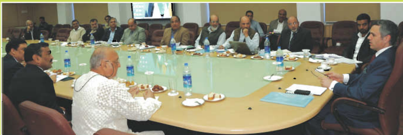
Hon'ble Chief Minister, Jammu and Kashmir, Shri.Omar Abdullah had a meeting with Hon'ble Chairman, Dr. Vijaypat Singhania in the presence of Minister of Animal Husbandry, Jammu and Kashmir and J. K. Trust officials

A meeting was held at Jammu on 19th November 2012 between Shri Omar Abdullah, Hon'ble Chief Minister, Jammu & Kashmir and Dr. Vijaypat Singhania, Hon'ble Chairman, JK Trust Gram Vikas Yojana, along with Minister of Animal Husbandry, Jammu & Kashmir and Senior Government officials.